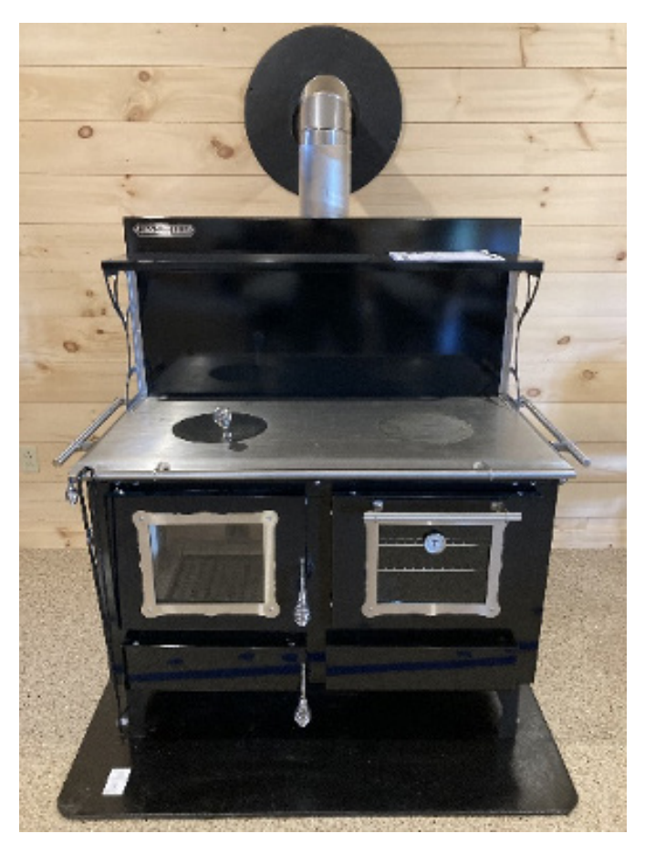
Figure 3. Amish-built wood-fired cookstove provides secondary heating and cooking capability. Many Maine houses utilize wood stoves for supplemental heating during the state's long winters.

approach for government buildings. Rowley came up with the idea after an ice storm caused the EMA's previous office to lose power, only to have an ill-timed generator failure. Rowley recalls, "So for the rest of the storm, we're operating in the office in the dark, in the cold. And I'm thinking, I've got a wood stove at home, but I don't have one here." Through its development of a load-shedding plan, Rowley figures the Waldo County EMA could double the amount of time the agency could operate with its existing fuel reserves.