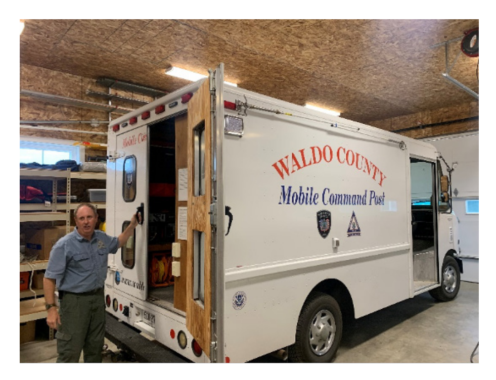
Figure 7. Waldo County EMA acquired this former bread truck and extensively overhauled and upgraded it to create a low-cost, high-capability Mobile Command Post.