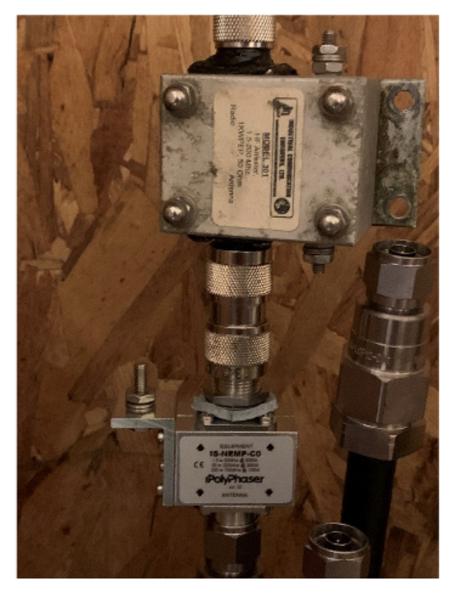
Figure 4. Placed sequentially, these filters are designed to protect radio equipment from potentially damaging electromagnetic surges.

power cables and lots of grounding. The radio room is served by its own electrical subpanel, which can be rapidly shut down by radio operators.