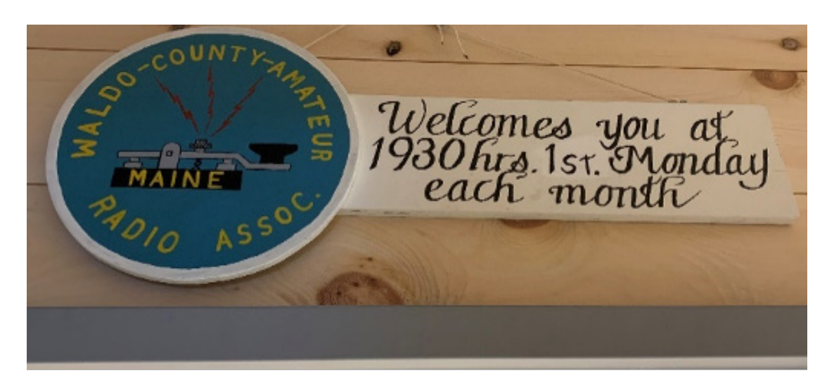
Figure 9. Allowing the local amateur radio club to use the EOC as a meeting location helps to integrate volunteer radio operators into Waldo EMA's preparations.

prepared at home, leaving them unable or unwilling to leave their families in the event of an emergency.