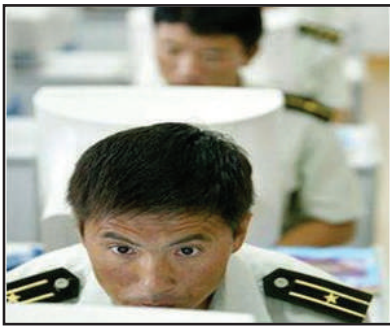
Chinese Cyber Hackers

A well-conceived and well-coordinated cyber-attack could also achieve many of the same effects, as noted by a former Director of the CIA, 16 the former Secretary of Homeland Security, 17 a former Secretary of Defense, 18 and the President himself. 19 Chinese preparations for a cyberwar include “soft” and “hard” kill options for network communications and critical infrastructure. “Soft-kill” attacks include disruption and damage using cyber hacking and infiltration, while “hard-kill” cyber-attacks are notably radio frequency weapons and missile delivery systems. 20 A recently reported cyber infiltration of a “honeypot” (a decoy) water SCADA (supervisory control and data acquisition) system by hackers believed to be associated with the Chinese Army could be indicative of things to come. 21