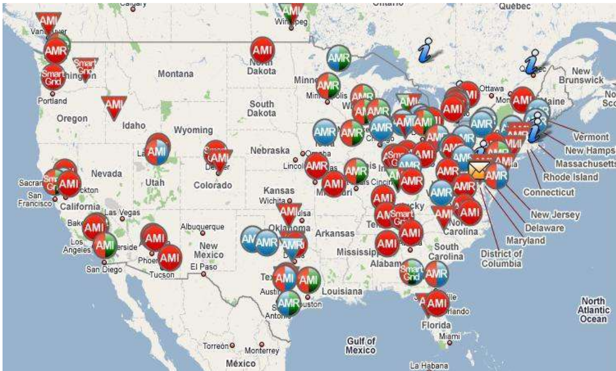
Figure 2. Map of smart metering initiatives in the United States as of March 2009.

Smart grid technology is now beginning to be deployed within the United States and other countries throughout the world. Figure 2 is a map 5 showing smart metering initiatives in the United States as of March 2009, which includes the location and the type of initiative. The initiatives shown in Figure 2 include only the initiatives that were reported to Google (see http://tinyurl.com/smartmapform ) and include electricity, gas, or water metering. Smart metering of various types has been implemented within the U.S. power grid during the last 15 years. AMR gained popularity by reducing meter reading costs and providing accurate and timely reads primarily via walk-by and drive by solutions. In fact, about one in every three electricity meters in the U.S. is now equipped with an AMR device to read consumption. 6 To fully implement the smart grid, these AMR devices will need to be replaced by AMI devices that provide two-way communications to the electric utility.