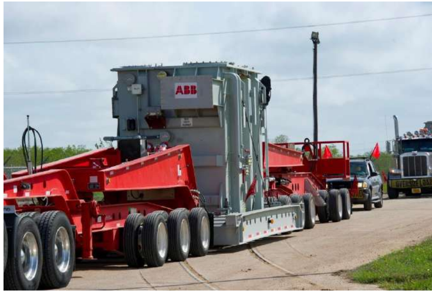
Figure 3. Transportation of the Recovery Transformer on the MA-65 custom trailer avoids the need to prepare a special surface or lay concrete at the substation prior to deployment.