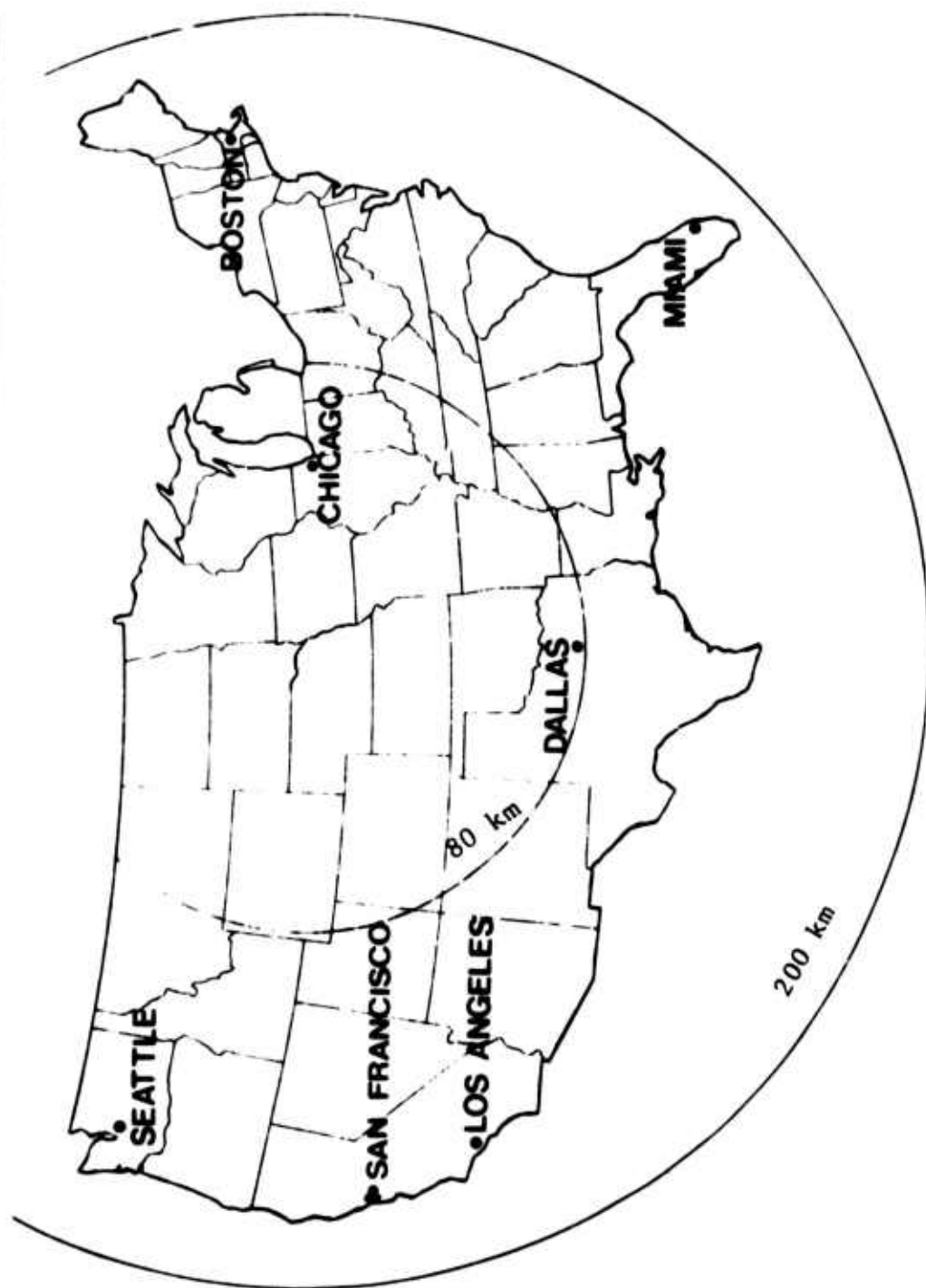
Figure 1 MAXIMUM GROUND COVERAGE OF HIGH ALTITUDE BURSTS FOR BURST HEIGHT OF EIGHTY AND 200 KILOMETERS

(Note that field intensity can vary within each area.)